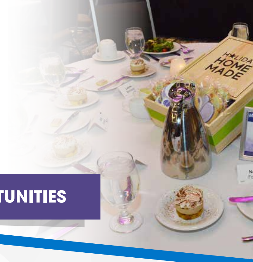
TABLE SPONSOR OPPORTUNITIES

Tuesday, November 19, 2024 Brookfield Conference Center