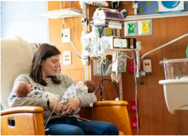
Rendering of the NICU twin patient room